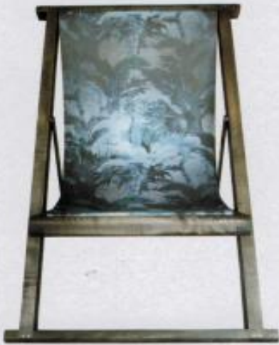
Eskayel Black Maple Sling Chair eskayel.com