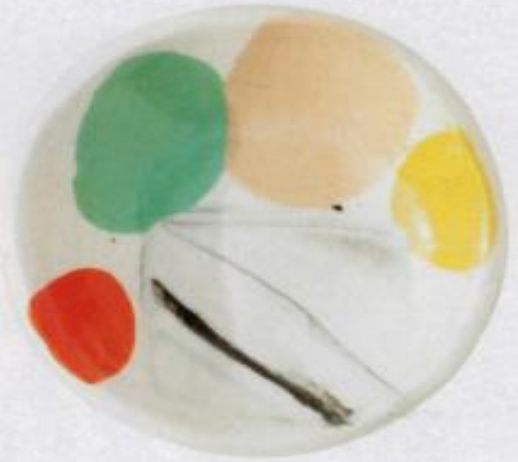
Gemstone Dish scosha.com