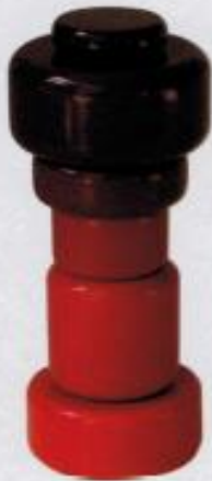
Pepper Grinder tomdixon.net