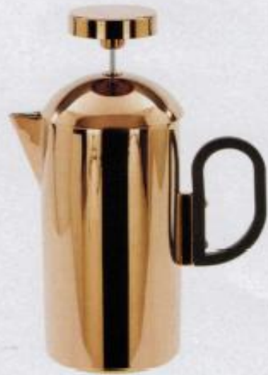
Tom Dixon Brew Cafetiere tomdixon.net